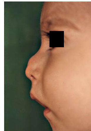
Fig. 1. Case 7: DC in the nasal dorsum.

The records of 12 patients with clinical diagnosis of DC were reviewed. Four cases were excluded (2 because the pathological diagnosis did not confirm the diagnosis of DC and 2 for incomplete records). Eight patients (3 girls and 5 boys) aged 0-12 years with a mean age of 2.7 years were included in the study (Table 1). Seven DC were diagnosed before 3 years of age, three of these at birth. Four DC were located in the oral region (3 sublingual and 1 lingual), 1 in the periorbital and 3 in the nasal areas (Fig.1). The mean diameter of the lesion was 1.7 cm