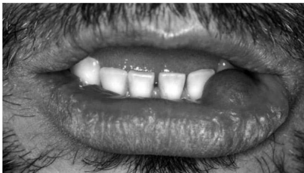
Fig. 3. Typical translucent mucocele on the lower lip mucosa.