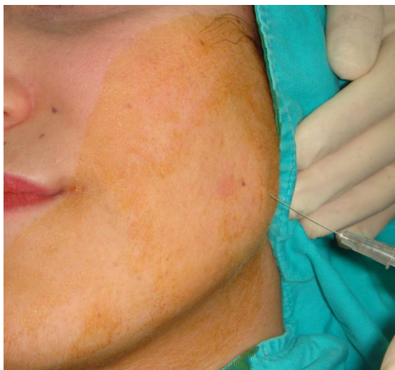
Fig. 3. Intramuscular injection of the botulinum toxin type A.

Facial paralysis was seen in case 1 that improved in 2 weeks. There was no postoperative complication in case 2. The patients were seen for follow-up examination, and within 3 months satisfactory masseter muscle atrophy occurred in both patients (Fig. 1b,2b). Both patients are pleased with their present facial appearance.