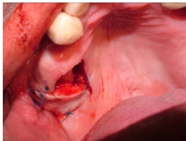
Fig. 2. Posteriorly based palatal rotation-advancement flap (case 4).