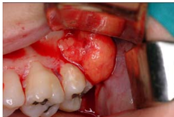
Fig. 3. Buccal fat pad was used to close a large defect (15 mm) in the tuberosity area (case 10).