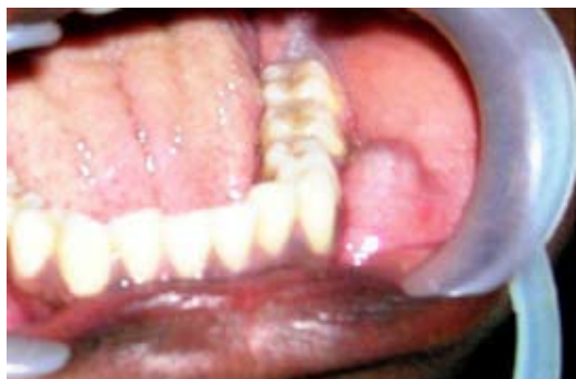
Fig. 1. Intraoral view showing the tumor in left mental foramen region with intact oral mucosa.

ry-like mass in his left mandibular body region. Intraorally, the swelling was seen in the periapical region of the left lower first premolar, extending anteriorly to the canine and posteriorly to the first molar, obliterating the buccal vestibule (Fig. 1). The overlying mucosa was intact and was normal in color. The swelling was firm in consistency, freely mobile and was not tender. There was neither a carious tooth nor any sharp cusp margins. No neurological abnormality was noted. All the teeth responded positively to pulp testing. Orthopantomograph failed to disclose any abnormalities.