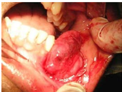
Fig. 2. Intra-operative photograph showing an encapsulated mass attached to the mental nerve.