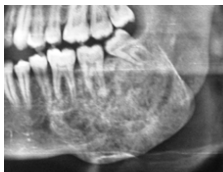
Fig 2b. Post injection OPG (13 months) showing complete radioopacity at the lesion site (case 2).