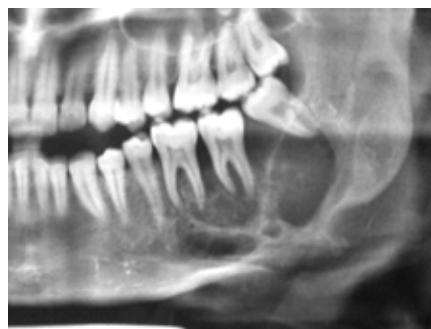
Fig 2a. OPG showing radiolucency in relation to teeth number 35 to distal of teeth number 38 and destruction of alveolus and inferior border of mandible (case 2).