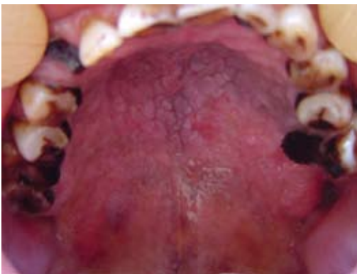
Fig. 2. Severe changes in palate associated to the reverse smoking habit.