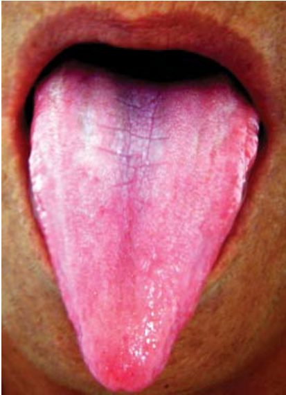
Fig. 1. Moderate changes in tongue associated to the reverse smoking habit.