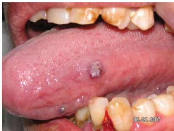
Fig 1. An erythematous papule over the left lateral surface of the tongue.

On dermatologic examination, no angiokeratomas were found anywhere on the skin.