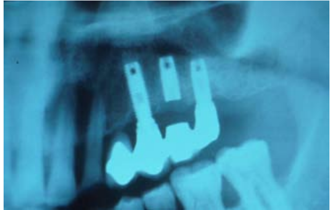
Fig. 10. Implant-supported fixed prosthesis. Apical portion of the fractured implant integrated in the maxillary bone.