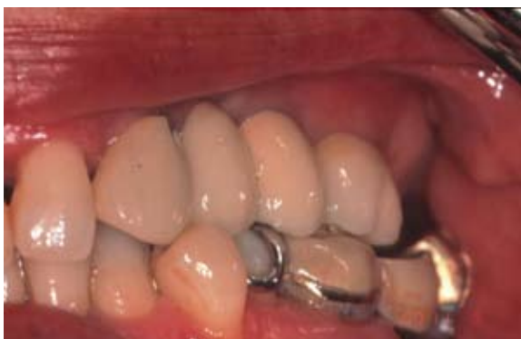
Fig. 8. Two Straumann AG® implants placed in the same surgical intervention (Case 1).

intervention (Figures 3-9). In the remaining 5 cases, regenerative techniques were used to prepare the bone bed for posterior implant placement.