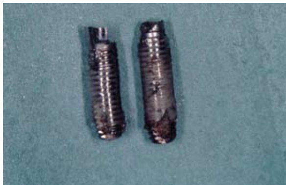
Fig. 6. Surgical view prior to trephine removal of the fractured implants (Case 1).