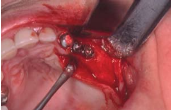
Fig. 5. Clinical view following bridge removal (Case 1).