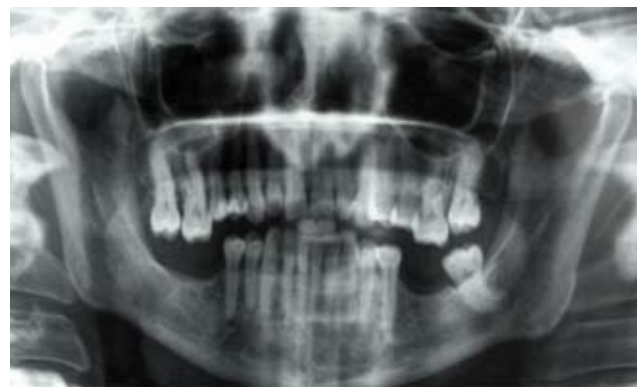
Fig. 1. Panoramic radiograph showing a radiolucent lesion in the right mandible.

The surgical specimen was described macroscopically as a 30-mm bluish and ovaled mass with surgical free margins. Microscopic examination showed a vascular proliferation of congested capillaries, surrounded by normal endothelial cells. There were no atypias or mitotic figures. The histopathologic diagnosis was cavernous hemangioma.