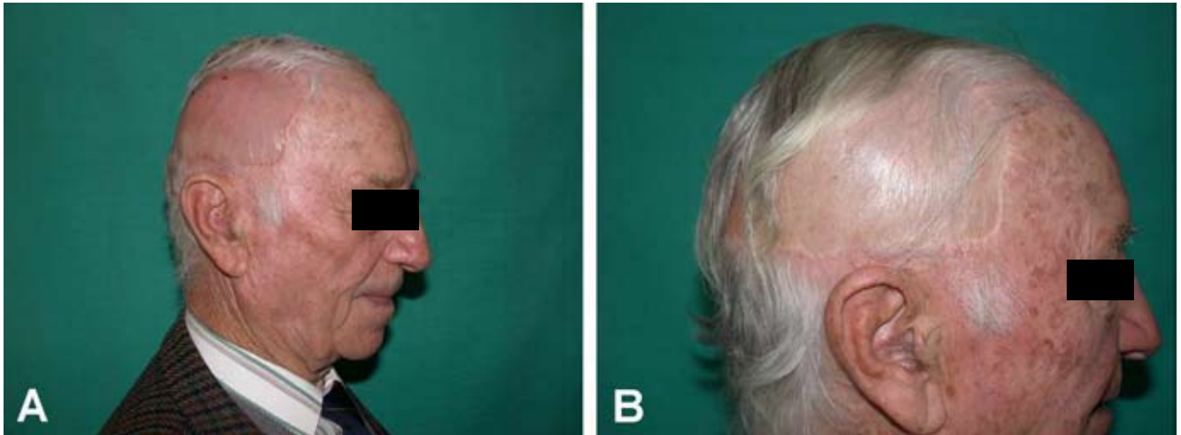
Fig. 2. Postoperative view. A: Four months after oncological surgery; B: Ten months after oncological surgery.

The island graft is a local graft variant composed of a scalp island without pericranium, with a vascular pedicle surrounded by subcutaneous tissue and an aponeurotic layer. It is mobilized to cover scalp defects (3).