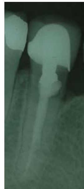
Fig. 4. Twenty-seven-month postoperative radiograph showing stable condition.