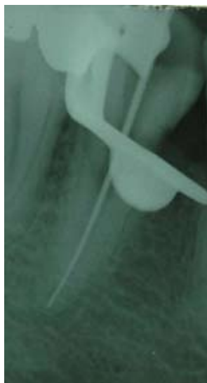
Fig. 2. Working length radiograph.