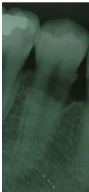
Fig. 1. Preoperative radiograph of the lower right second premolar with invasive cervical resorption and root perforation.

At the next visit, determination of the working length was done using an electronic apex locator (Root ZX®, J Morita Corporation. Kyoto, Japan) and radiograph (Figure 2). Canal enlargement was then performed using nickel-titanium rotary instruments (Profile, Dentsply Tulsa, Tulsa, OK, USA). At the third visit, which was one week after initial visit, MTA was mixed with sterile water to a paste consistency following the manufacturer's instructions. Local anesthesia was administered, and MTA was applied into the cervical resorption defect with a small plugger through the coronal access cavity with small increments. MTA was gently packed against the dentinal wall and the gingiva. The remaining root canal was filled with gutta-percha points and sealer (AH26, Dentsply, Konstanz, Germany) using a lateral condensation technique (Figure 3). An amalgam core was added, and the treated tooth was restored with a porcelain-fused metal crown. The tooth has been asymptomatic since the obturation. The patient was recalled regularly, and he was clinically and radiographically asymptomatic up to the 27-month follow-up (Figure 4).