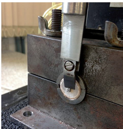
Fig. 3: Specimen adapted to a shear-testing device.

The specimens were adapted to a universal testing machine (Instron Universal 4440- C6600, Barueri, SP, Brazil) with the base of the bracket fins perpendicular to the applied force (Fig. 3). Then, a shear strength of 1.0 mm/min was applied until the fracture, converting the recorded scores in Newton (N) into MegaPascal (MPa), as follows: MPa = N/area.