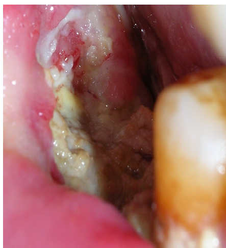
Fig. 1. Clinical aspect of the intraoral lesion. Osseous tissue lesion exposed to the oral cavity.