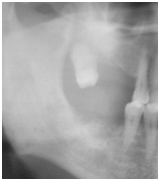
Fig. 2. Orthopantomography. Irregular osseous rim with areas of recent osteitis in relation to the tooth 4.7.