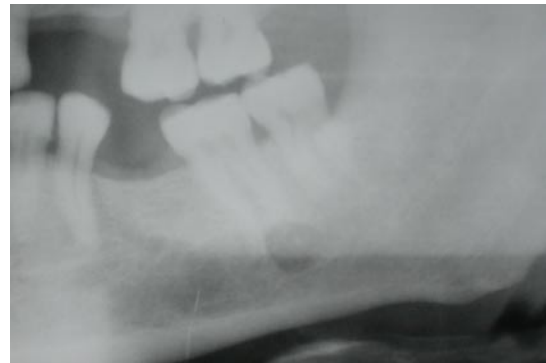
Fig. 4. Stafne cavity located in the apical area of the 3.7. (Case N° 4)

Defenders of this etiology support their argument essentially on the results of sialographies and surgical findings. Our results appear to be in accordance with this theory, since glandular tissue was found within the defect of the 3 patients subjected to sialographies of the submandibular gland and in two of the patients intervened surgically. However, in two of the patients operated on the cavities were empty, which could be explained by the accidental displacement of tissue during surgical manipulation, or by the actual position of the patient during surgery. Other congenital or embryonal etiological factors have been described, especially deficient bone formation in the area previously occupied by Meckel cartilage. (1, 3, 6, 12) The facial artery could also be associated with these defects, given that an abnormal vascular pressure could originate necrosis and resorption of the adjacent bone. (1, 3, 6, 7, 12)