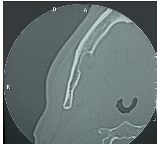
Fig. 2. Axial section of the CT showing the peripheral origin of the lesion and the preservation of the lingual cortical. (Case N° 2)