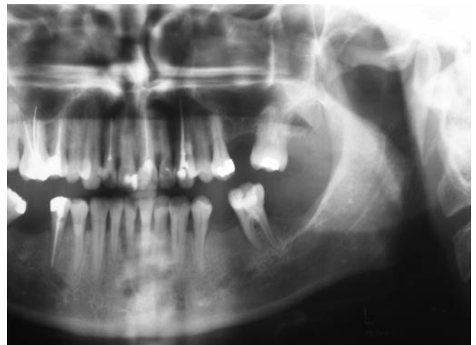
Fig. 2. A large coronoid process was observed.