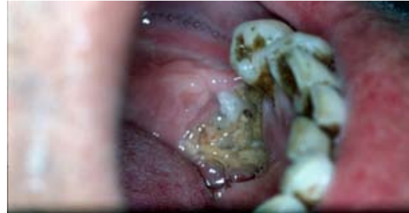
Fig. 1. Exposed bone in the area surrounding tooth 34.

Treatment was initially administered by the protocol described above, with local daily treatment from Monday to Saturday over a period of two weeks. The hydrogel was injected into the cutaneous fistula until its intraoral exit was verified on both sides. After two weeks the fistulae had