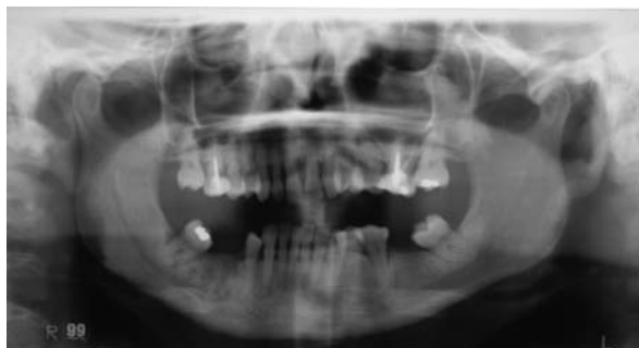
Fig. 7. Orthopantomography of the case 2.

healed. Currently, after a 7-month follow-up period, there has been no sign of fistulae recidivation and, although the bone is still exposed in the mouth, there is no pain or suppuration. The prosthesis does not cause any discomfort and he can eat without difficulty. He still smokes. He is not taking antibiotics and is reinforcing his oral hygiene with a chlorhexidine mouthwash.