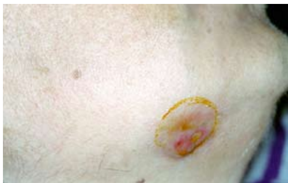
Fig. 6. Fistula in the submandibular region.