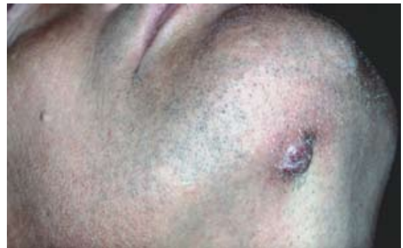
Fig. 3. Fistula in the submentonian region.