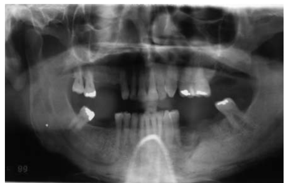
Fig. 4. Orthopantomography of the case 1.