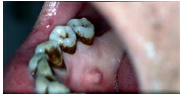
Fig. 2. Mucous fistulae.