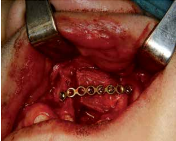
Fig. 1: The bone block was fixated to the adjacent maxillae with a long titanium micro-plate.

complications such as wound infection, oronasal fistula and bone graft exposure by intraoral examinations. Preoperative and follow-up (1-week, 3- and 6-month) CBCT scans were taken with the same radiation parameters. All data with DICOM format was imported into Simplant Pro 11.04 software (Materialize, Leuven, Belgium) and the coronal, sagittal and horizontal planes of the block iliac bone graft were evaluated. To perform volume rendering, the block iliac bone graft was outlined on each slice using the drawing tools of Simplant software. Collection of all slices with the bone block was stacked to produce a 3D structure and the volume calculation was performed with the same protocol described in previous studies (6,10,14). The volume calculation for each case was repeated three times by the same observer (YC Tang) and the mean data at different follow-up time points was presented with V1 (1-week postoperative), V3 (3-month postoperative) and V6 (6-month postoperative). The resorption rate was calculated as a percentage using the formula (V1-V3 \text{ or } V6)/V1 \times 100\% (6).