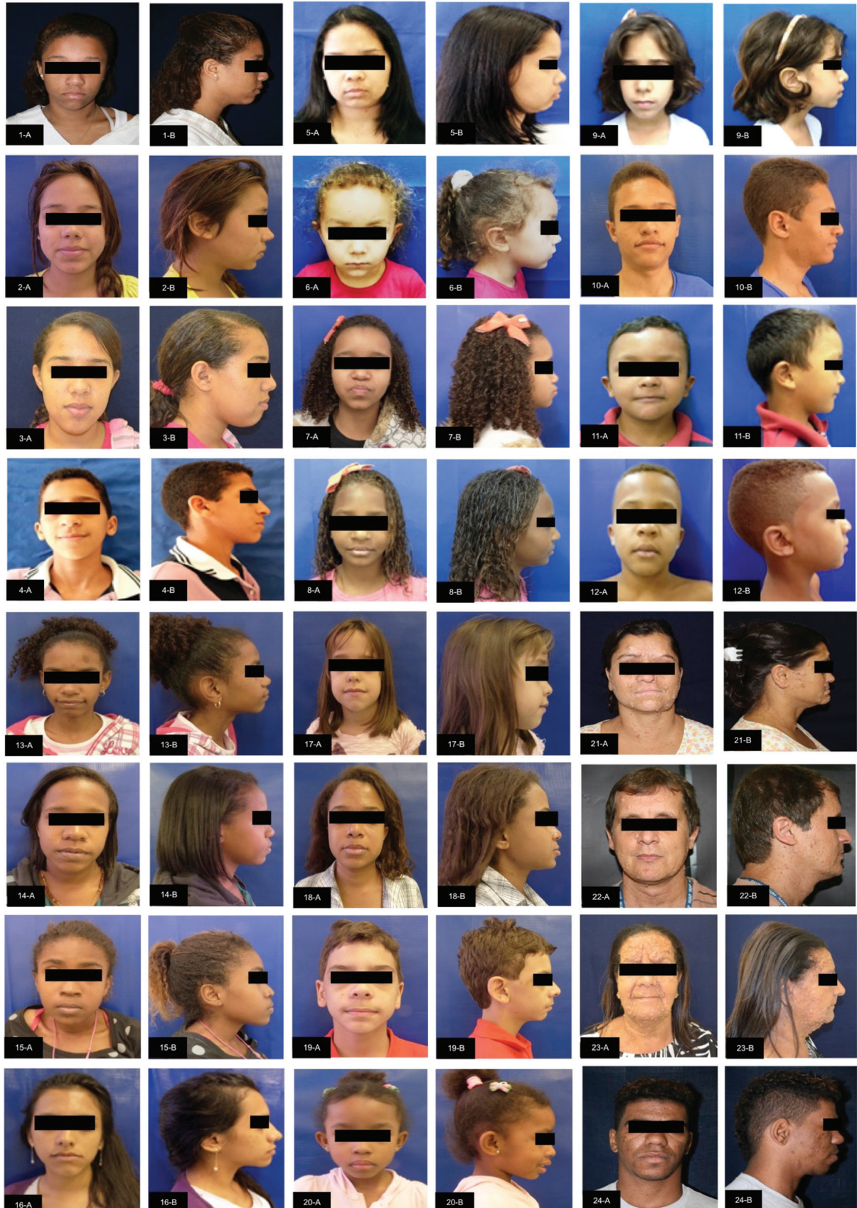
Fig. 1. A. Facial clinical aspects of the individuals with neurofibromatosis 1 (patient 1-24) Front (A) and lateral (B) views.