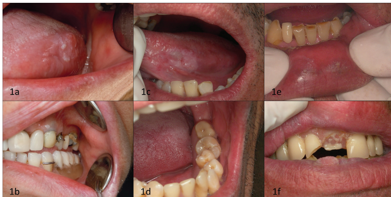
Fig. 1. Clinical cases of oral cancer associated to chronic mechanical irritation. a,b) Female (53 years old), non-drinker and non-smoker, presenting a squamous cell carcinoma on the border of the tongue. Given the inverted overbite, the bicuspid proclination and lack of canine guide, the patient involuntarily bite the area for more than three years. c,d) Male (44 years old), non-smoker, drinker of more than 350,000 gr of alcohol. Lateral tongue border presents a verrucous carcinoma. This area was in relation to CMI originated by the lingual position of lower premolars and molars and a defective partial removable denture, both in contact with the lesion for more than four years. e,f) Male (55 years old), smoker of more than 200,000 cigarettes and drinker of more than 600,000 gr of alcohol. The patient had a leukoplakia without dysplasia. A year later, an upper removable denture was broken, and since then a verrucous carcinoma began its growth in the injured site.

• Oral cancer in relation to the aforementioned traumatic factors that should be present before the patient awareness of the lesion (tumor or ulcer). This data was gathered through oral inspection and anamnesis, taking special caution regarding recall bias. Figure 1 shows clinical examples of CMI's associated carcinomas. Particularly 1c and 1d offers a good illustration of this point, where a verrucous carcinoma of left border and ventral surface of the tongue can be seen in contact with both teeth and removable dentures. Teeth are in a manifest malposition (particularly lower left 2 nd molar and 2 nd bicuspid). Although the patient could not remember with certainty when dental IMC started (originated be-