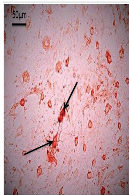
Fig. 3: SMSCs at 3rd passage differentiated into osteoblasts and stained with Alzarin red. (arrows indicating lower calcium mineralization deposits).