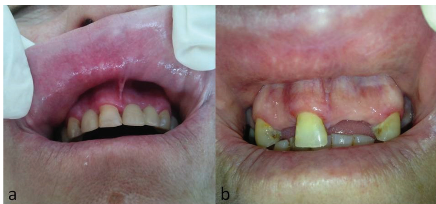
Fig. 2. Patient #21. (a) Striation and erythema of the upper labial mucosa and upper facial gingiva. (b) Same patient, complete resolution of lesions after topical application of corticosteroid ointment and chlorhexidine gel. Teeth extractions were performed due to periodontitis after lesions had healed.