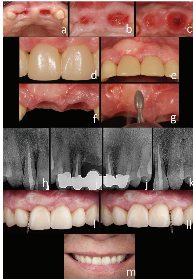
Fig. 3: a, b, c) Improved soft tissue volume. d, e, f, g) The third surgical phase was performed before the final prostheses were placed. A diamond burn was used to remove part of the grafted epithelium. h, i, j, k) A significant improvement in the underlying bone was observed, despite no bone grafting having been carried out. l, ll) After the second surgery, the soft tissue margin of the papilla was 3–4 mm more incisal than before the surgery. This represented an improvement of approximately 4 mm in the periodontal junction. Three years later, the clinical results recorded within three months of surgery had not only been maintained but had in fact improved, as there was no “black triangle” in the lateral and central incisor area. m) Final situation after three years.