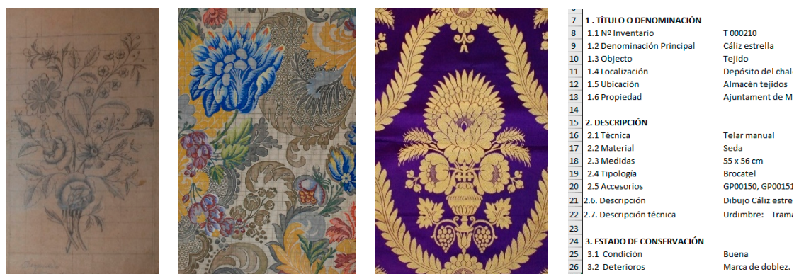
Figure 3. Examples of types of input data considered for the project. Images from left to right: a sketch; a technical drawing; a silk textile; and text associated with an image. Images belong to Garín 1820 S.A. [21].

In SILKNOW we will deal with a variety of input data related to historical silk textiles, in order to process them and derive a set of outcomes. Therefore, the system will be able to deal with heterogeneous (regarding to the various ways of discretizing and storing data), multilingual (English, Spanish, French and Italian) and multimodal (text, videos and images of different nature) data, gathered from various collections throughout Europe, and processed in order to ensure interoperability. In Figure 3 a few examples of input data are shown.