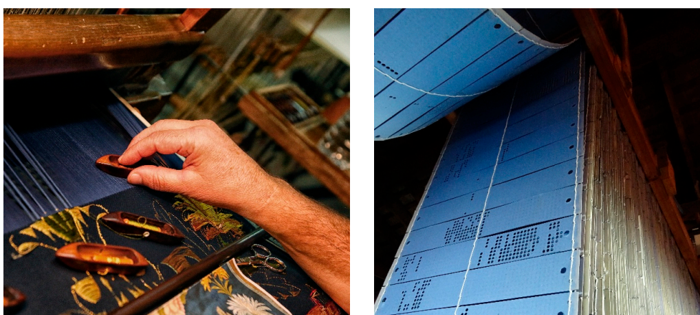
Figure 1. Jacquard looms: an artisan weaving a textile (left); punched cards that embed the textile's drawing (right).

In this regard, the connection between computing and silk textiles is not new. In fact, 19 th -century Jacquard looms [18] are reported to be the most direct ancestors of modern computers, since a number of punched cards laced together into a continuous sequence controlled their operation (Figure 1, right). Much later, this evolved into computer programming and data entry [19,20]. In a similar fashion, state-of-the-art computing can help to maintain the tangible and intangible heritage related to silk textiles.