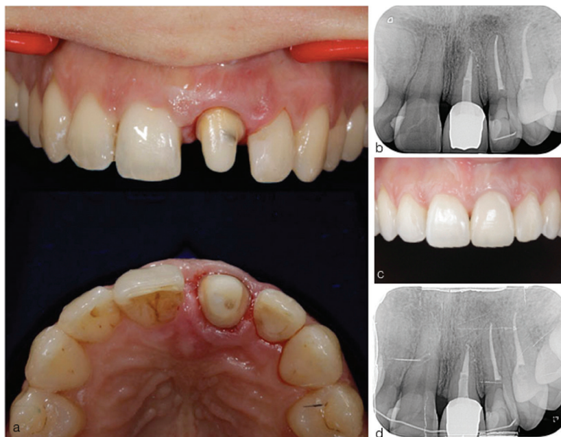
Fig. 3: (a) Crown preparation (b) post-operative radiograph (c) post-operative labial view (d) radiograph taken after 4 years of treatment.