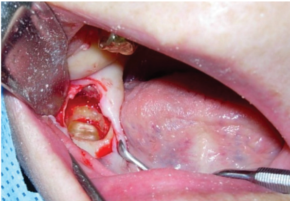
Fig. 2: Case 8. Intraoperative accesses after coronectomy.