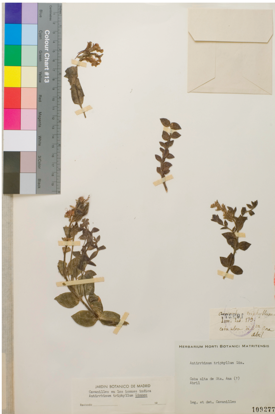
FIG. 3. — Syntype of Linaria cavanillesii Chav. (MA 109277). Transcript of the original label: Antirrhinum triphyllum /Icon. Tab. 179/Cova Alta de S ta Ana/Abril. © Herbarium MA, reproduced with permission.