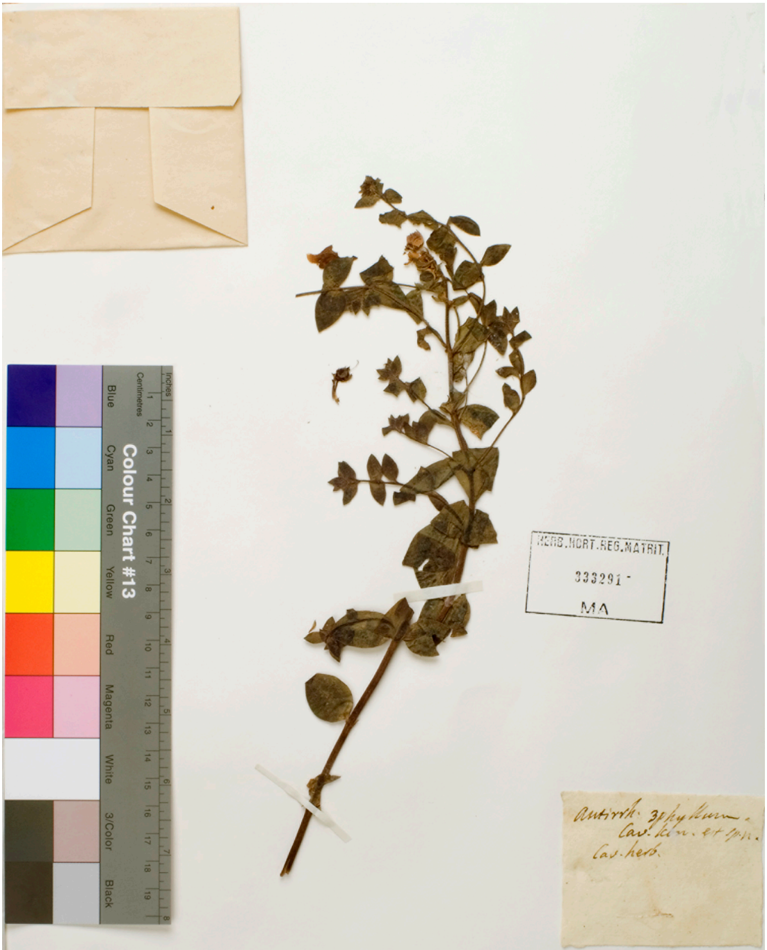
FIG. 4. — Syntype of Linaria cavanillesii Chav. (MA 333291). Transcript of the original label: Antirrhinum triphyllum /Cav. Icon. est sp. n./Cav. herb.