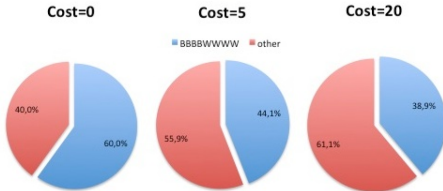
Figure 4: Fraction (%) of BBBBWWWW outcomes across treatments.