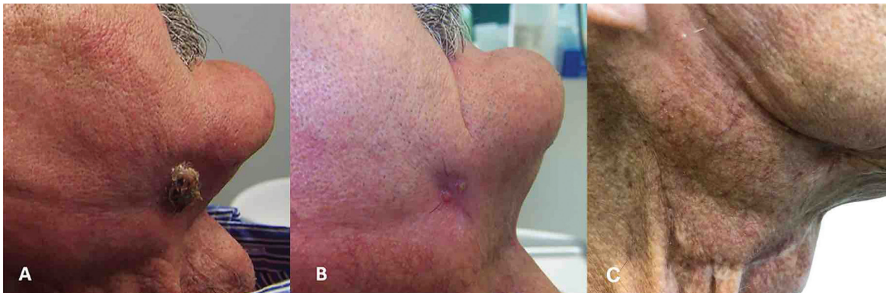
Fig. 2: Extraoral fistula: A) August 2009 B) October 2011 C) August 2018.