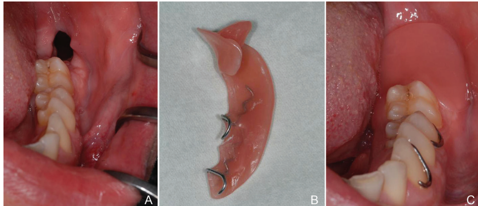
Fig. 1. (A) the cyst opening 7 days after decompression; (B) customized obturator; (C) applied customized obturator.