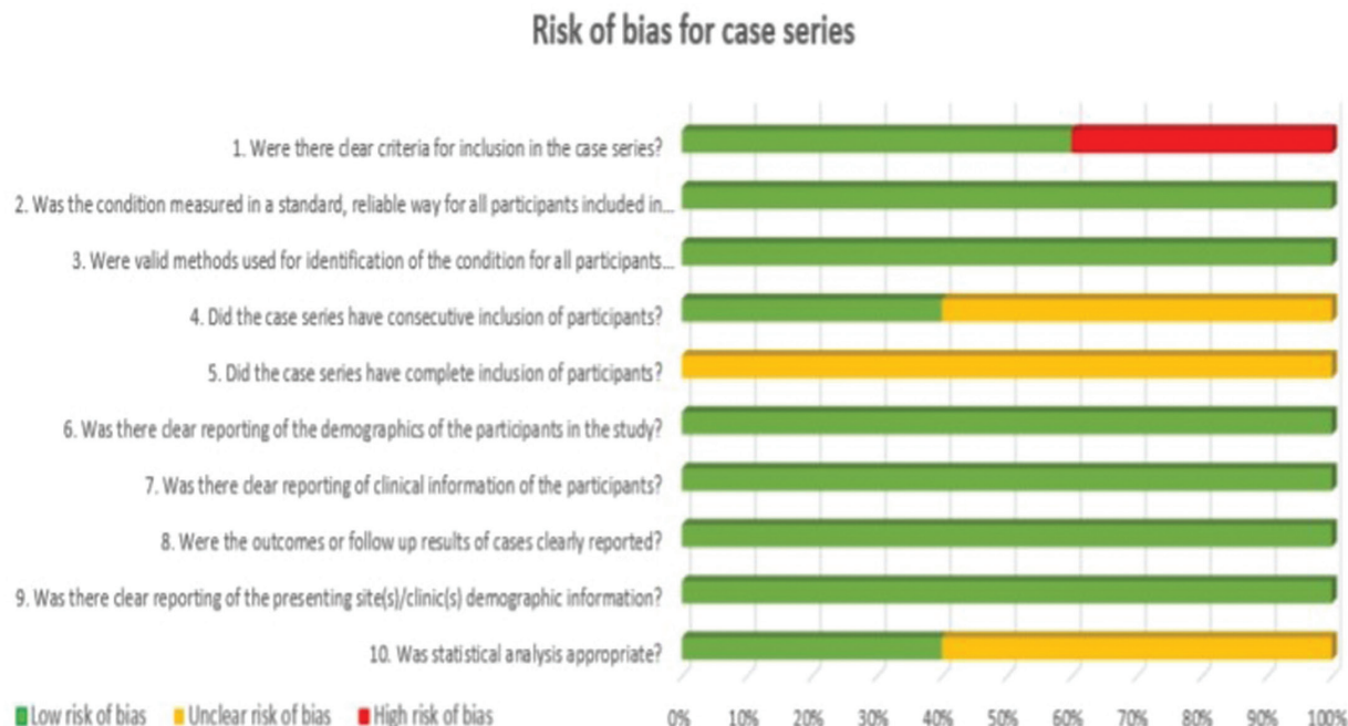
Fig. 3. Risk of bias across studies for case series.

en and 77 (75.49%) were men. Data from 2 (1.96%) patients were not available (5). Regarding age, the average age was 57 years (minimum-maximum 19-70). Of these patients 58 (56.86%) developed ONJ, of which 38 were males (66%), 11 females (19%) and 9 cases did not specify sex (15%). The average age of the patients with ONJ was 56 years.