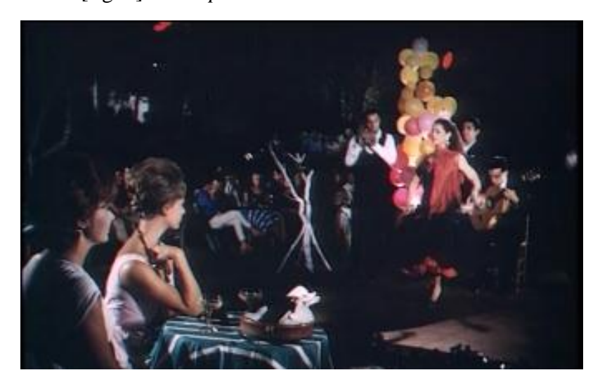
Figure 7: El último verano

Digression is more noticeable in films in which the characters become the spectators of musical performances and folk dances that contribute very little to the development of the story, its setting or characterisation. In fact, these shows could be perfectly replaceable by others without affecting the story. Stand out in this regard the Flamenco show in Todo es posible en Granada , Veraneo en España , El último verano [fig. 7] and España otra vez .