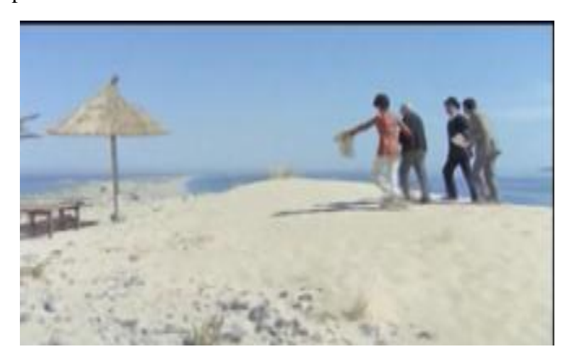
Figure 2. En un lugar de La Manga

power. This dimension is certainly important but exceeds the interests of this study, which is focused on the treatment of space in tourist films.