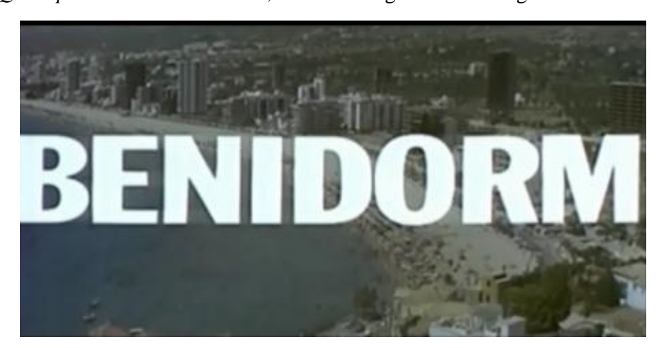
Figure 3. Un beso en el puerto

In most of the analysed films the referential space dominates [fig. 3]. This space is identified by its name, through dialogues, banners justified or not by the diegesis, characteristic monuments or buildings present in establishing shots and even in the titles of films: Todo es posible en Granada ("Everything is possible in Granada"), Un americano en Toledo, Bahía de Palma ("Palma Bay"), Escala en Tenerife, Playa de Formentor ("Formentor Beach"), En un lugar de La Manga , among others. It is common for films to use more than one resource to mention the name of the location in which the events happen. The referential space contributes to the generation of a realistic effect, but also allows the viewer to identify it clearly. The most prominent exceptions are Una vela para el diablo and ¿Quién puede matar a un niño?, which belong to the horror genre.