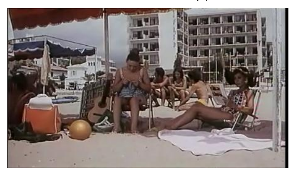
Figure 4: Verano 70

Tourist space can be characterised as an idyllic paradise - Congreso en Sevilla, Todo es posible en Granada, Luna de verano, Amor bajo cero and Escala en Tenerife , among many others- or as an aggressive place. In fact, in the analysed films there is an evolution from the former to the latter, even in the comedies of the 1970s. In movies like Cuarenta grados a la sombra and Verano 70 the tourist space, especially on the coast, is presented as a distressing and crowded place [fig. 4]. The Mise-en-scène , saturating the shot composition with plenty of characters and objects, seeks to generate this effect. The reaction of many male characters in this situation -or rather using this situation as justification- is to flee towards non-tourist places to work. The space acts here as an obstacle in the fulfilment of the male characters' mission: to enjoy some freedom.