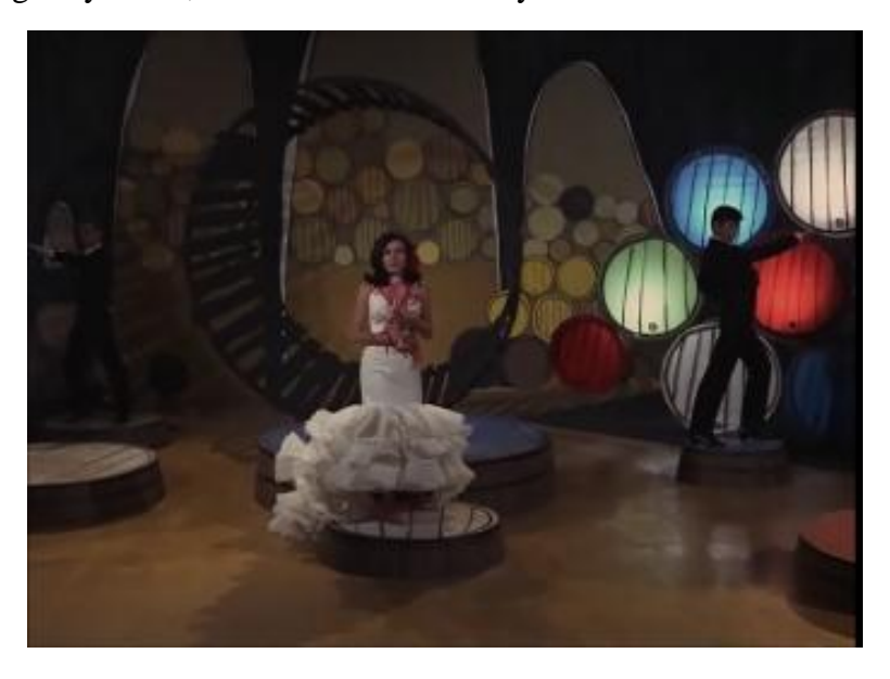
Figure 5: En Andalucía nació el amor

Tourist space can also become a fantastic space. As Álvaro del Amo (2009: 24) points out, a characteristic feature of some types of Spanish comedy is "the willingness to apply a particular style to things, [...] to incorporate weird, strange, unusual things [...], the capacity to move from 'reality' to the world of 'dreams', from what is 'seen' to what is 'imagined'". This special feature exerts a great influence on tourist comedies. Sometimes they are nothing more than audiovisual representations of desires and frustrations —in Luna de verano one of the French tourists cannot stop imagining her teacher with armour and spear; in Lo verde empieza en los Pirineos , Serafin, due to a childhood trauma, imagines the attractive women have beards—, although it involves a change of scenery that breaks with the realistic tone of the diegesis—in Manolo , la nuit , Manolo's wife fantasises about the possibility of her husband having a harem—. In other movies, however, fantasy has a clear link with tourism. This is the case of Todo es posible en Granada , En Andalucía nació el amor [fig. 5], Un beso en el puerto and Veraneo en España , where peripeteias lead to more or less folkloric and more or less justified imaginary states, which are almost always resolved with a musical number.