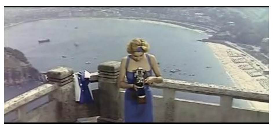
Figures 9 and 10

Without a doubt the resources of interest concentrate most of the tourist views. As it is known, the complications (the problems caused by the characters' inherent characteristics), the obstacles (the problems derived from the situation) and the antagonistic actions (the problems provoked by the antagonist) prevent the character from fulfilling his mission and reaching climax. In the case of En un lugar de la Manga , the sequence prior to the first turning point (motivated by antagonistic actions) takes place in El Carro villa. The mise-en-scène and especially the planning and camera movements revalued the landscape. There are also explicit references to it. In Luna de verano , which offer plenty of tourist views of San Sebastián through establishing shots, there is one of the best examples of integration of tourist views, mise-en-scène and resources of interest. After the first turning point -postponed in the endless first act-, once the two students/tourists already have a mission, to get the love of their teacher Juan, the first frustrated attempt to fulfil their mission develops in places privileged by views of San Sebastián and its surroundings. The frame composition allows spectacular views to have as much prominence as the events [fig. 9 and 10] given that it minimises characters in some shots, leaving wide spaces between them and the frame, and uses a depth of field that shows the characters and paradisiacal landscapes with similar clarity.