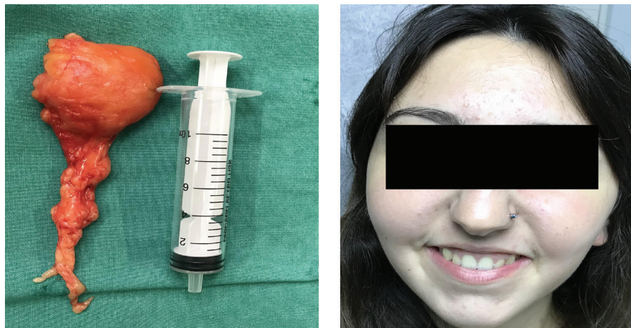
Fig. 3: A) The lipoma of the right side after removal. B) The patient two weeks after surgery.