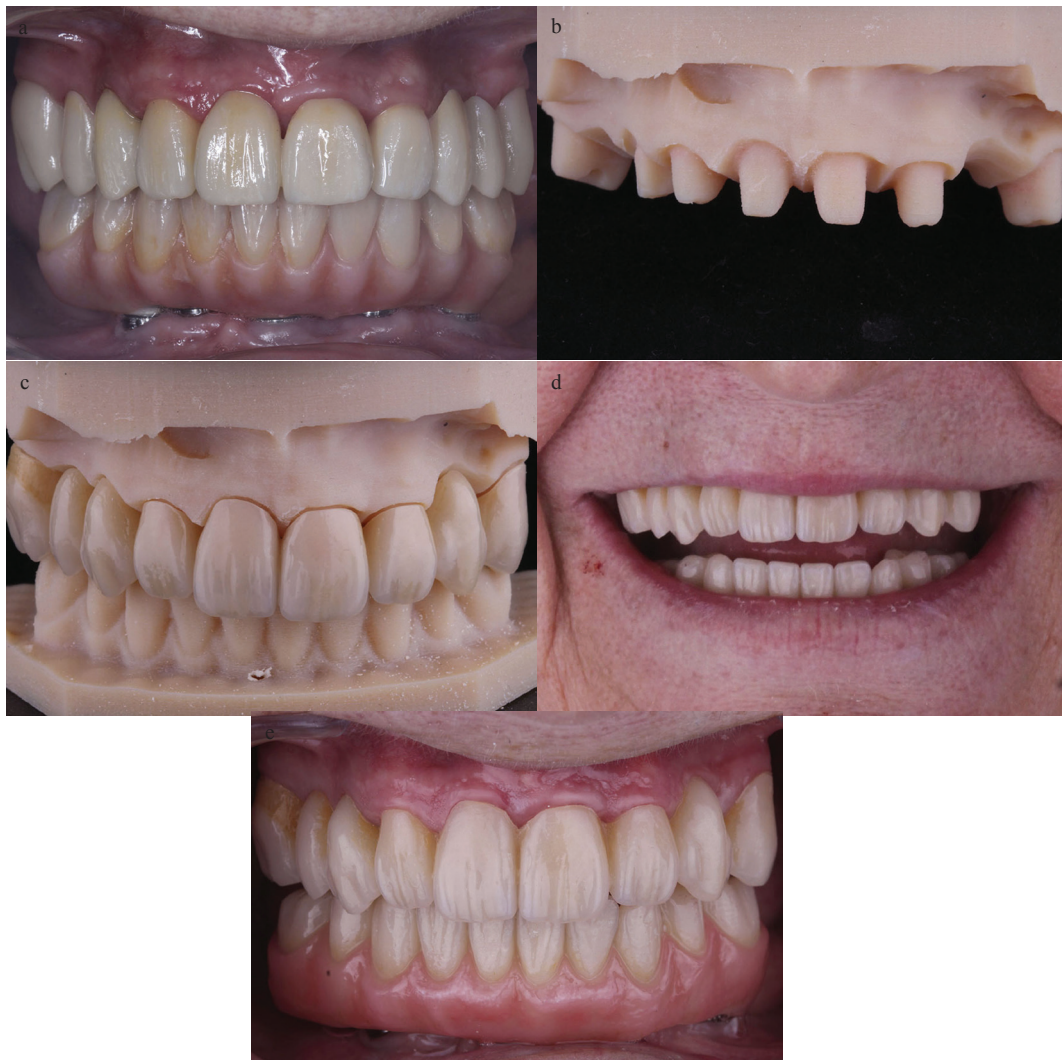
Fig. 3: A) Wax try-in denture. B) 3D-printed working cast. C) Definitive fixed dental prosthesis made from PMMA reinforced with graphene. D) Post-treatment extraoral view of smile. E) Frontal view of the definitive maxillary fixed dental prosthesis made from PMMA reinforced with graphene.

The present clinical report used GO as a novel additive in PMMA resins to overcome the resin's mechanical properties. According to several authors, the incorporation of carbon nanotubes, such as GO, in acrylic resins may enhance the resin's mechanical properties (14) and decrease the degree of contraction during polymerization