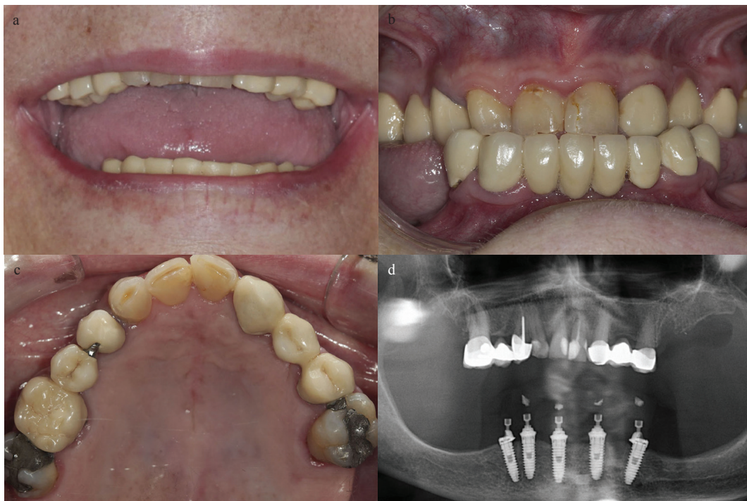
Fig. 1: Initial clinical situation. A) Extraoral view of smile. B) Frontal view of maximum intercuspation. C) Occlusal view of the maxila. D) Panoramic radiograph.

The clinicians decided to extract the compromised molars and restore the other teeth with a fixed dental prosthesis, to increase the vertical dimension and replace missing dental pieces. For occlusal reasons and to avoid distal extensions in the lower prosthesis, no implants were placed. All preparations were made using a biologically oriented preparation technique (BOPT) of vertical preparation without finish lines.