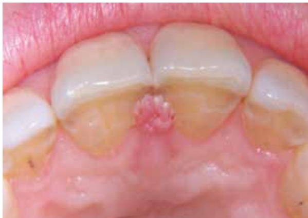
Fig. 1: Preoperative view of OSCP located in the interincisal palatine papilla.