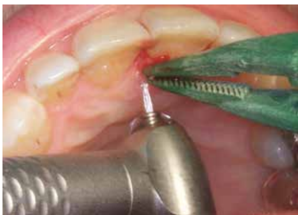
Fig. 2: Excision of the lesion with the Er,Cr:YSGG laser.

means of a Chi-square test in order to assess differences in recurrence rates between groups were performed.