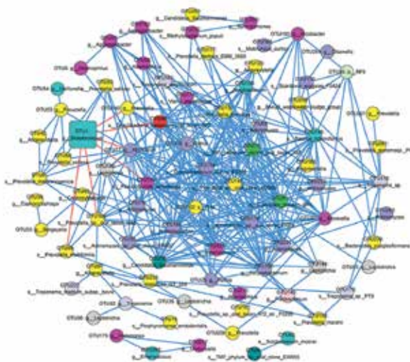
Fig. 3: Co-occurring network of interactive bacteria between HC and CG groups. The co-occurrence network was constructed based on the sequenced OTUs with Pearson's correlation coefficients |r| > 0.8 and Permutation test P < 0.01 . Each node represents an OTU. HC and CG were labeled by Box and Circle, respectively and the size represented the relative abundance of OTUs. The blue and red lines indicated positive correlations and negative correlations, respectively.

Analyses at the OTU level showed that 151 OTUs were significantly different between CG patients and HC individuals. so we calculated the Pearson's correlation coefficients for the 151 OTUs and generated a co-network between CG patients and HC individuals (Fig. 3).