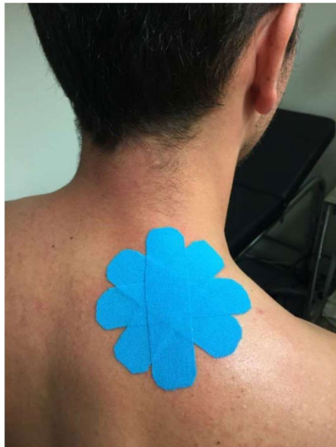
Figure 1. KT application (space-correction technique) on MTrPs in the upper trapezius.

In trial A, a pilot study was conducted with 20 participants, assigned randomly and equally to two groups (KT and sham tape). In order to determine the sample size, a power analysis was performed using the G*Power (v3.1.9.2) program; 40 patients per group would provide 90% statistical power at a 5% significance level (effect size f=0.165 ) according to algometer scores between groups. To accommodate the expected dropout rate before the study's completion, a total of 48 participants were included in each group.