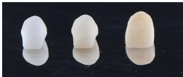
Fig. 1: Color measurement of colored Zr core on white background and color measurement of white Zr core on black background.

used for recording color coordinates (L,a,b) of each coping/crown (Fig. 2). Copings were cemented using silicone index for group WC and CC whereas for group MZ, body stains were used as external stains on crowns.