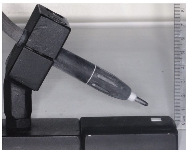
Fig. 2: Custom made laboratory jig for APA surface treatment.

Jig was constructed to standardize 60 degrees angle and 1cm distance between application tip and zirconia surface for group (A) specimens (Fig. 2). Zirconia holder