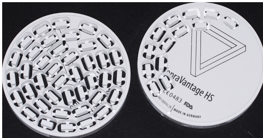
Fig. 1: Milled zirconia cuboids.

size of resin cuboids obtained from plexi. Another transparent plexi-frame was cut to act as floor. The 2 plexis were placed above each other. SDR composite was then injected into cuboidal mold created in the middle of plexi. Histology glass slide was placed onto to ensure flat composite surface which was then light cured. After curing, 2 plexis were separated from each other and composite was pushed from cuboidal space.