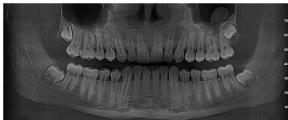
Fig. 1: Preoperative panoramic view X-ray reconstruction from a CBCT. It is possible to observe the size of two cystic lesions involving teeth 12 and 22. Also, four impacted third molars present and an incidental left maxillary sinus mucosal cyst finding.

apicoectomy of teeth number 13, 12, 22, 23, cystectomy of both cysts, and bone substitute augmentation/filling in the area with autologous graft material obtained from wisdom teeth participation. Teeth number 18 and 28 (dystopically) impacted with tooth calcification Nolla's 15 stage 7 for tooth number 18 and stage 6 for tooth number 28, as they can be seen on Figure 1.