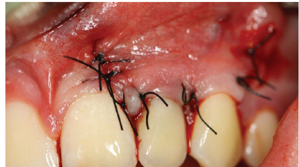
Fig. 4: Final suture with Supramid® 3-0 (B. Braun, Germany), repositioning the mucosal flap in its initial position.

Patient's postoperative Panoramic X-ray of six months after the surgery (Fig. 5) and clinical examination were corresponding to normal healing process.