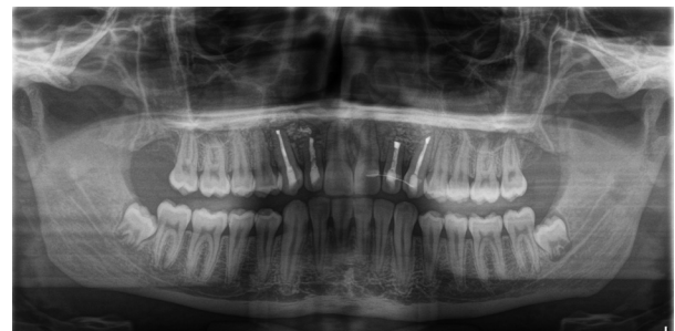
Fig. 5: Panoramic X-ray after three months presenting the surgical site and the teeth which were involved in the procedures.