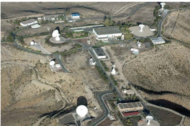
Figure 5. Panoramic view of the Maspalomas Tracking Station (INTA).

The chapter web site was created in 2017 as a tool to gather key information and activities from the chapter and announce upcoming news and events to the community. It was created through IEEE’s web hosting service and tools and is allocated at http://sites.ieee.org/spain-grss/ . The web site also includes links to other organizations and resources involving GRS research and education in Spain and it is our aim to keep it dynamic, and updated with the most relevant information for the community.