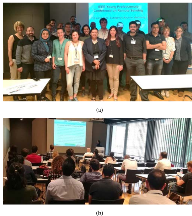
Figure 3. IEEE Young Professionals Remote Sensing Conference: (a) group of participants and (b) photo of one of the oral sessions.

The actions for 2019 are planned with the idea to promote the visibility of the Chapter activities, to attract new young