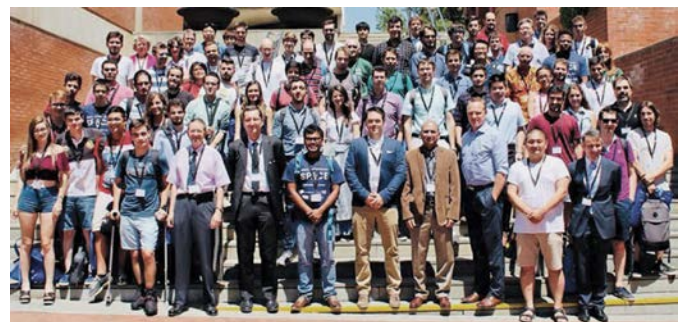
Figure 4. Group of attendees, professionals and organizers, during the YP in Space 2018 conference.