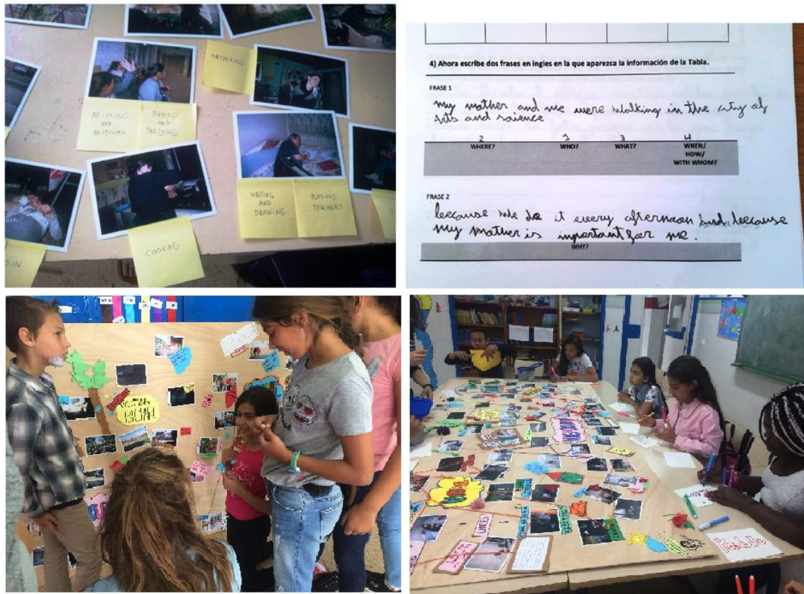
[Figure 4. Phases of the second workshop: ‘All the world’s a board!’]