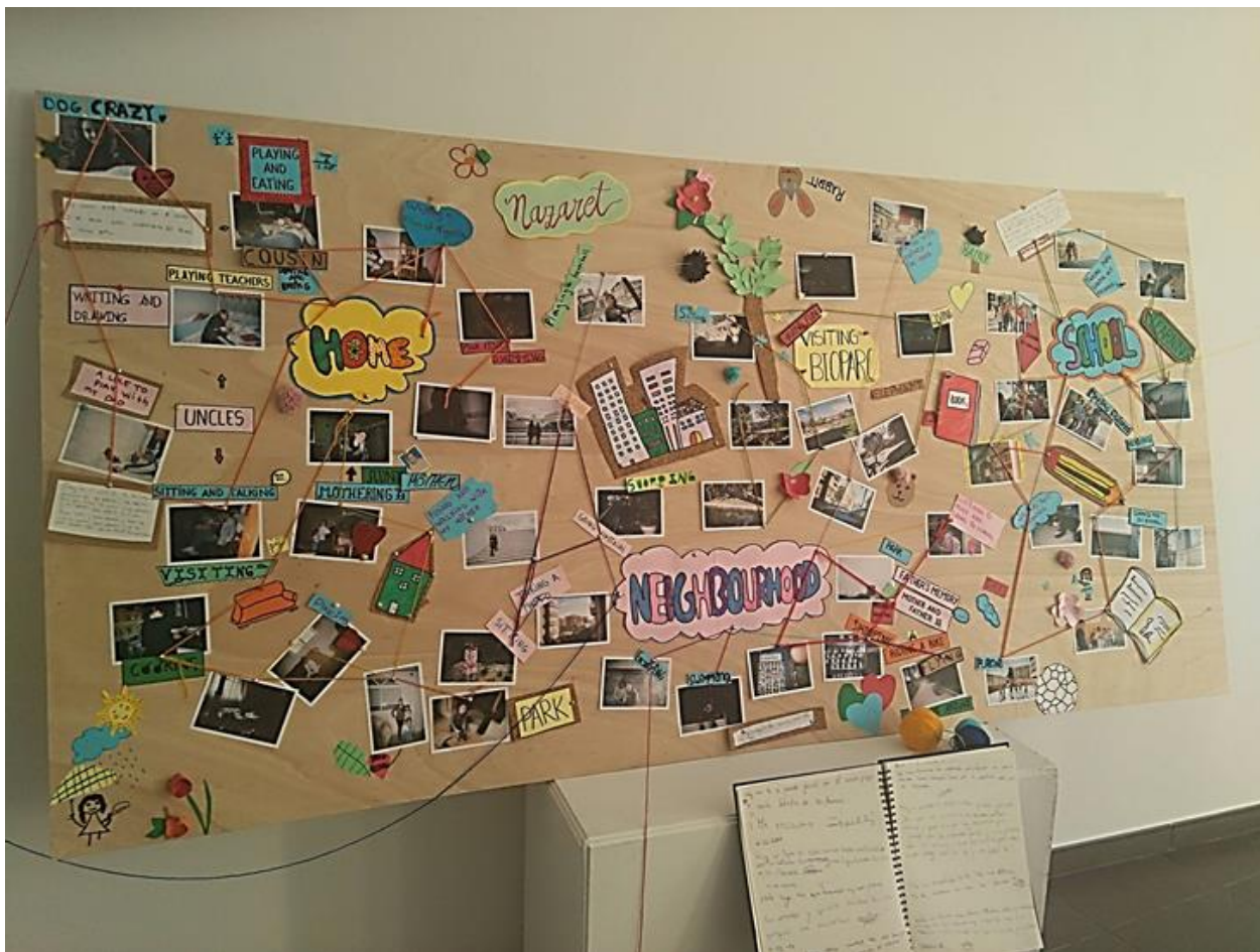
[Figure 5. Final outcome of 'All the world's a board!']