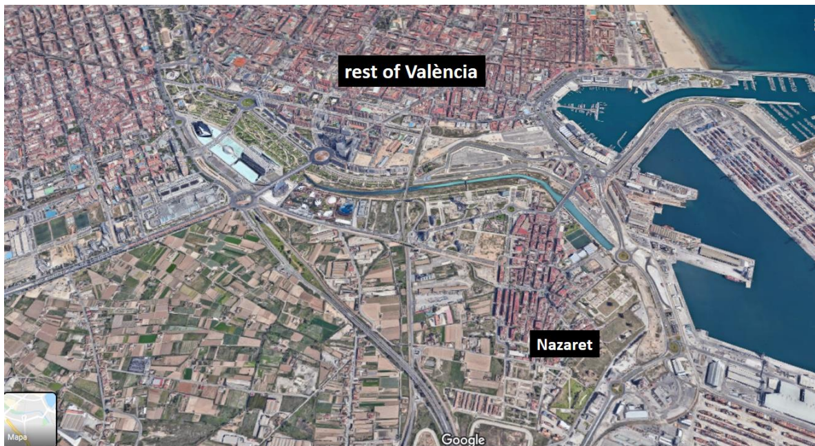
[Figure 1. Map of Nazaret in València]