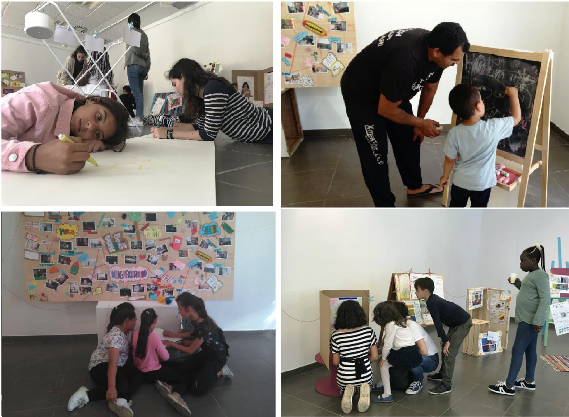
[Figure 6. Words matter/ Palabras reales exhibition]