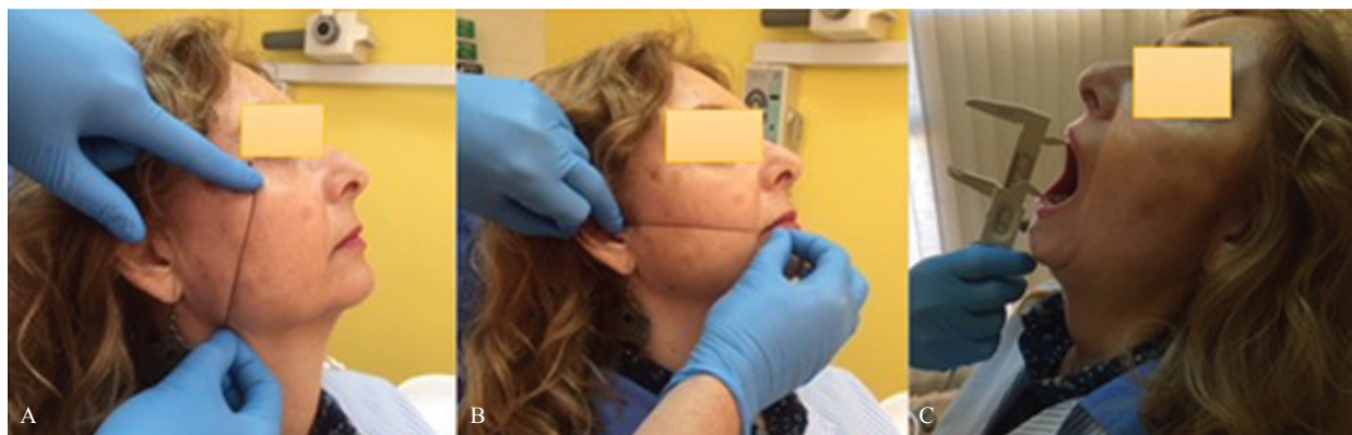
Fig. 1: The distance from the external edge of the eye to the cutaneous area of the gonion (mandibular angle) (A) and the distance from the tragus to the oral commissure (B), as well as trismus (C).

A third researcher (operator 3) gave each patient a leaflet to record the intensity of pain by using a visual analogue scale (VAS) (17), every hour for the first six hours after tooth removal, and in the morning and at night on a daily basis until day 4. The patients had to write down the number of analgesic capsules they took at all times. Inflammation or edema was objectified by following the technique described by Amin and Laskin in 1983 (18), measuring by means of 2/0 dental floss of 20cm in length the distance from the external edge of the eye to the cutaneous area of the gonion (mandibular angle), and the distance from the tragus to the oral commissure previously marking the anatomical landmarks on the skin with a fine-tip permanent marker pen rather than henna (Fig. 1). These measurements were taken by researcher 3 just before and 72 hours after surgery. Depending on the obtained results, these were classified according to the increase in measurement: no inflammation (0mm), mild inflammation (1–5mm), moderate inflammation (6–10mm) and severe inflammation (>10mm). Prior to beginning this phase of the study, training and calibration of researcher 3 was carried out to achieve the ability necessary to correctly implement such measurements.