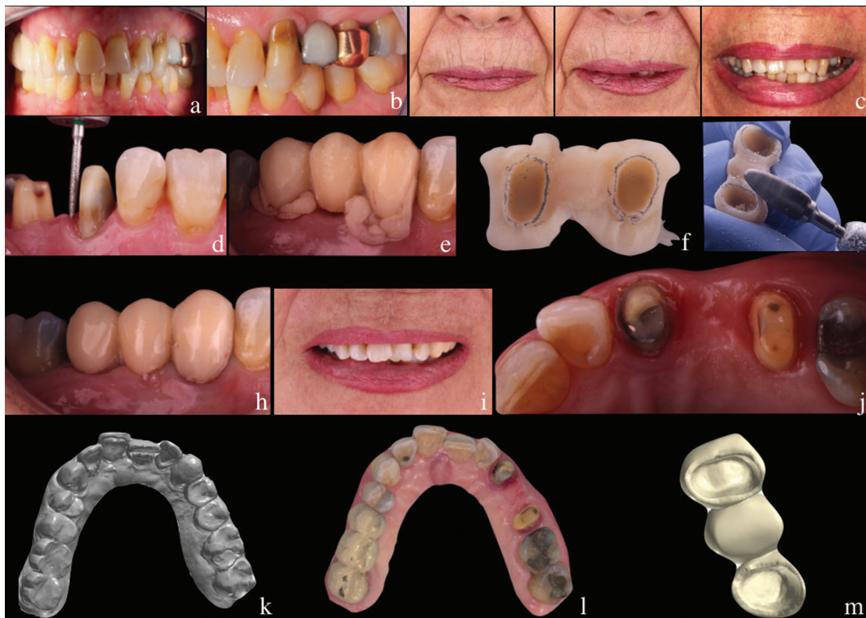
Fig. 1: A) Preoperative intraoral view in frontal vision; B) Preoperative intraoral view in lateral vision; C) Sealing, rest and maximum smile; D) Teeth prepared without finish line; E) Relined of temporary FPD; F) Modification of temporary FPD to obtain ideal gingival emergence, G) Polished of temporary FPD; H) Cementation of temporary FPD; I) maximum smile with temporary FPD; J) soft tissue state after provisional time; K) Digital impression of Temporary FPD cemented; L) Digital impression of abutment teeth; M) Extraoral scanning of the temporary FPD.

-Definitive Digital Impressions (DI) were made by the following clinical protocol (11). A first scan with the provisional restoration in the mouth, a second scan of the dental preparations, and a third scan of the provisional restoration out of mouth. The second and the third