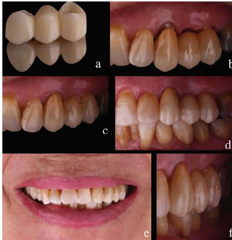
Fig. 2: A) PolyMethylMethAcrylate (PMMA) test; B) Try-in previous cementation; C) Final restoration; D) 12 months follow-up; E) Smile after 12 months; F) Soft tissue state after 12 months.

Summary of statistics for all three scanners and conventional impression for substrate trueness are presented in Table 1. The mean measurements in terms of trueness in teeth were as follow: STS [0,039 mm], SI [0,054 mm], STD [0,067 mm]; while in soft tissue were as follow: STS [0,051mm], SI [0,09 mm], STD [0,236 mm]. The