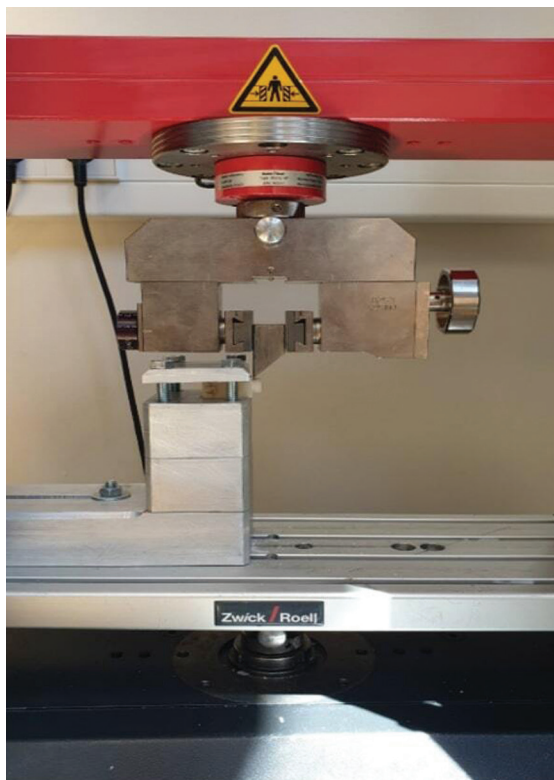
Fig. 3: Setup in the universal testing machine Z010.