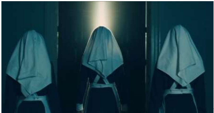
Figure 7: The