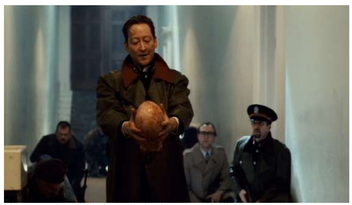
Figure 9: Malcom holds Macbeth's head surrounded by the thanes.

Despite doubts, during their respective journeys, many of Macbeth's generals find room for decency. Attempts to help others have been seen. Katabasis is a self-questioning passage for all since conclusions depend on what individuals make out of their journeys. If contemporary violence can be narrativized as katabasis, as Falconer argues, the phenomenon can also be transformed, resisted and destroyed (2007: 5). Nevertheless, affirmative katabatic narratives can be a distraction when they focus on demonizing the absolute other. Again, returns from hell do not lead to Paradise but to keep on alert, to negotiation with individual and collective trauma derived from the journey.