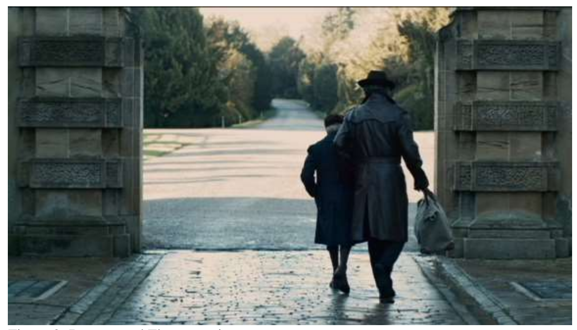
Figure 2: Banquo and Fleance trying to escape.

"Macbeth moves between these two opposed realms, as between blessings and curses, angels and devils, and (...) between heaven and hell" (xv-xvi). However, after challenging fate "into the list" (3.1.50-73), Stewart's Macbeth, rifle in hand, turns to the mansion to speak with the murderers. He sides with evil.