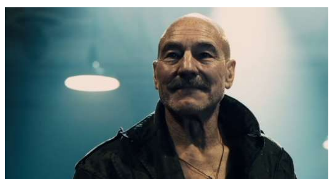
Figure 6: Macbeth smiles at the Witches before dying.