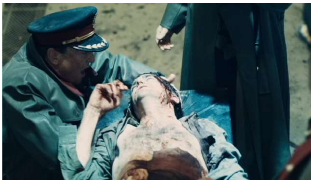
Figure 4: The Bleeding Sergeant reporting the battle at the underground hospital.

filial figure to Stewart's Macbeth since they are similar in complexion and both share a desire to eliminate the upper class, a wrathful impulse they get to satisfy in the butchering of the Macduffs. Before confronting the English army, Macbeth says "I 'gin to be aweary of the sun" (5.5.48) – a pun referring to both the "sun" and the "son" – while gently caressing the porter's head. Macbeth develops an attachment to violent young men and disgusts those wanting to side with decency.8