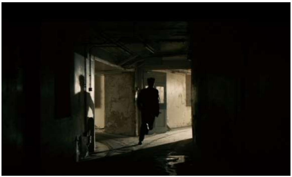
Figure 3: Donaldbain running to the light.