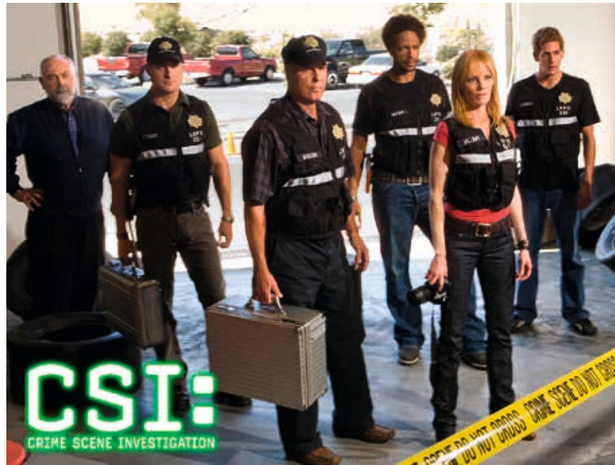
One of the most important problems in forensic medicine is the so-called «CSI effect». Most TV series present forensic evidence as infallible – one hundred percent reliable, with no margin for doubt – when reality is very different: the scientific validity of forensic tests is variable. In the picture, promotional material from the TV series CSI.

Forensic genetics pioneered the quantification of the value of evidence by using probabilities. When genetic polymorphisms are analysed in biological smears and we try to ascertain whether they correspond to an individual whose DNA is also analysed, we need to calculate the probability that