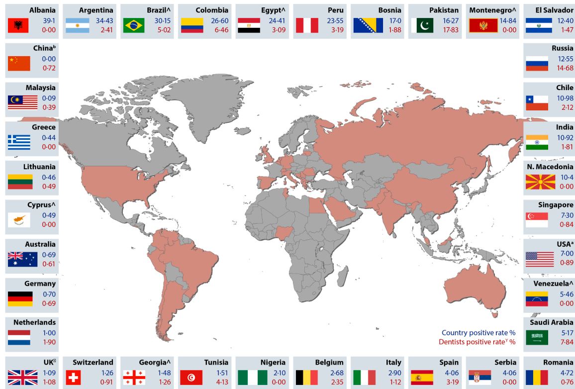
Fig. 1. COVID-19 positive rates by countries. In blue colour, is reported the COVID-19 positive rate of the population (%) at the time point when the survey was conducted, while in red the cumulative COVID-19 positive rate (%) among dental professionals since the beginning of the pandemic.

a USA/California; b China/Hubei; c Pakistan/Lahore; https://www.worldometers.info/coronavirus