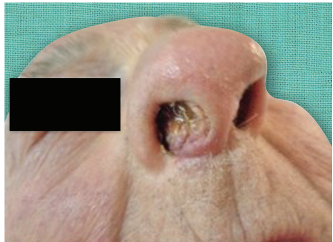
Fig. 1: Patient with septal tumor with columellar involvement, stage II (T2N0M0)

In the radiological studies, none of the cases presented adenopathies suggestive of malignancy, and therefore they were all staged as N0. The anatomopathological results of the biopsies taken from the lesions were all classified as epidermoid carcinoma. In patients with stage II lesions, due to their anterior location and the columellar involvement, a combined approach was used: endoscopy and an open procedure, performing a lateral rhinotomy to achieve broad exeresis of the tumor. In order to ensure tumor-free margins were obtained, in all cases a complete exeresis of the columella was carried out due to its affectation or infiltration of adjacent structures. An endoscopic approach to treat the lesions was used both on the patient with the earliest stage tumor (stage I) and in the most advanced stage tumor (IVa).