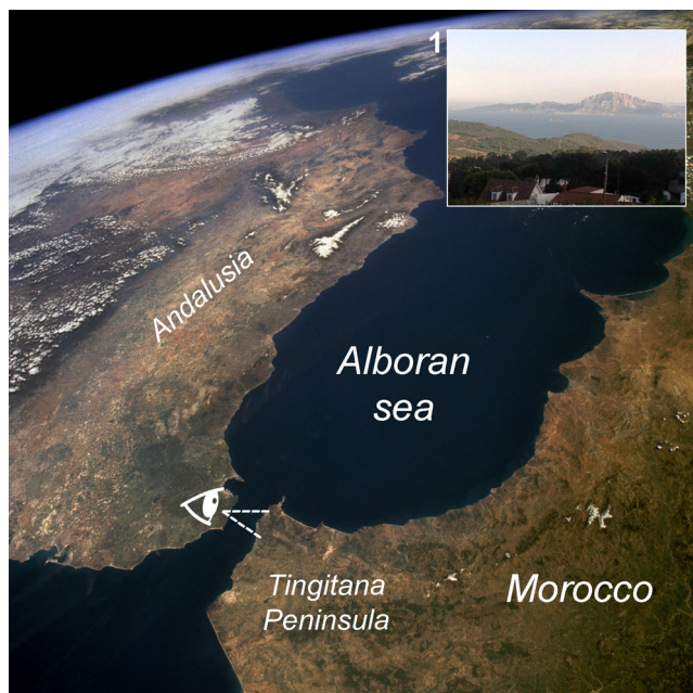
Figure 1: Satellite view of the Strait of Gibraltar in the geographical framing of southern Iberia and Northern Morocco. NASA archives. (1) in the upper-right angle, detail of African shore (Jebel Musa) from Andalusian (Tarifa) territory (2020, RMMS).

The first pottery recorded on the Maghreb coast, within a reliable chronological range, was found on the Tingitana peninsula. The ceramic assemblage includes mainly impressed vessels, many of which are